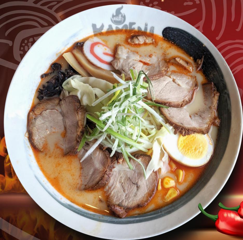
K1 VOLCANO CHASHU Spicy Grilled-Pork Ramen 辛い豚骨ラーメン 17.95

Are you up for the challenge? Try to keep calm with this ramen that's made with a capsaicin extract - roasted pork, egg, fish cake, black mushroom, bamboo shoots, scallions, corn and cabbage