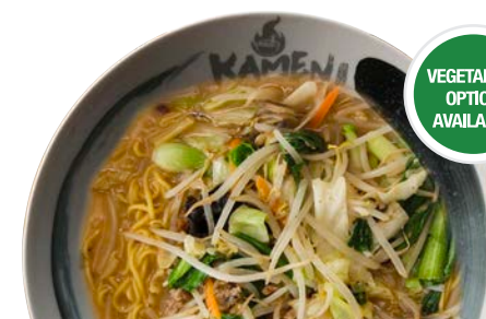
M2 SAPPORO MISO KAMEN 札幌味噌ラーメン 14.95 "Fire-flavoured" Sapporo ramen (originated in Sapporo, Japan) - Choice of ground pork or chicken, bean sprouts, mushroom(w/b), bok choy, cabbage, carrot and scallions