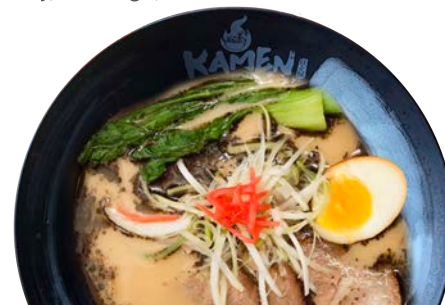
T2 BLACK GARLIC TONKOTSU 黒豚骨ラーメン 15.95 Hakata-style pork bone soup with roasted black garlic oil, bok choy and Tonkotsu ramen toppings