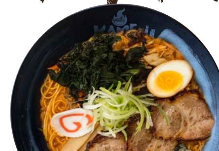
S3 KING KAMEN 王のラーメン 17.95 Super-premium Kamen - roasted pork, ground pork, egg, mushroom(w/b), cabbage, carrot, scallion, fish cake, bean sprouts, bamboo shoots, fresh & dried seaweed