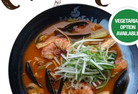
S4 FIERY SEAFOOD KAMEN 激辛シーフードラーメン 18.95 "Fire-flavoured" spicy seafood ramen - fresh mussel, scallop, squid, shrimp and vegetables with chili oil and fresh chili peppers