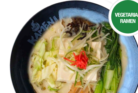
V1 FRESH TOFU RAMEN 黒豚骨ラーメン 13.95 Tonkotsu-esque flavoured broth - fresh tofu, mushroom(b), bok choy, cabbage, bamboo shoots, scallions and red ginger