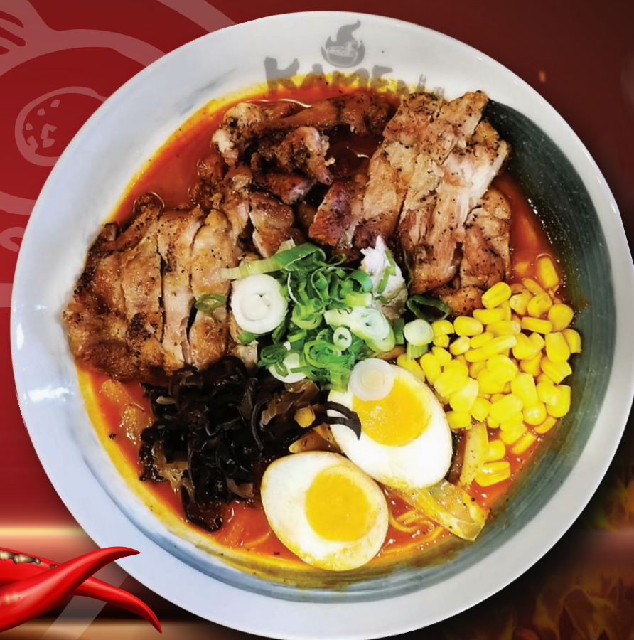
K2 VOLCANO TORI Spicy Grilled-Chicken Ramen 辛い火鶏鳥ラーメン 17.95

Are you up for the challenge? Try to keep calm with this ramen that's made with a capsaicin extract - roasted pork, egg, fish cake, black mushroom, bamboo shoots, scallions, corn and cabbage