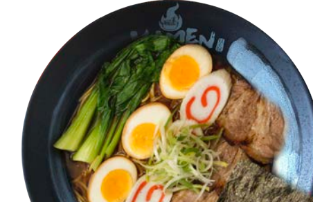
Y2 ULTRA SHOYU ウルトラ醤油ラーメン 17.95 Super-sized shoyu ramen - 2x noodles, roasted pork, eggs, fish cake, bok choy, scallions and dried seaweed